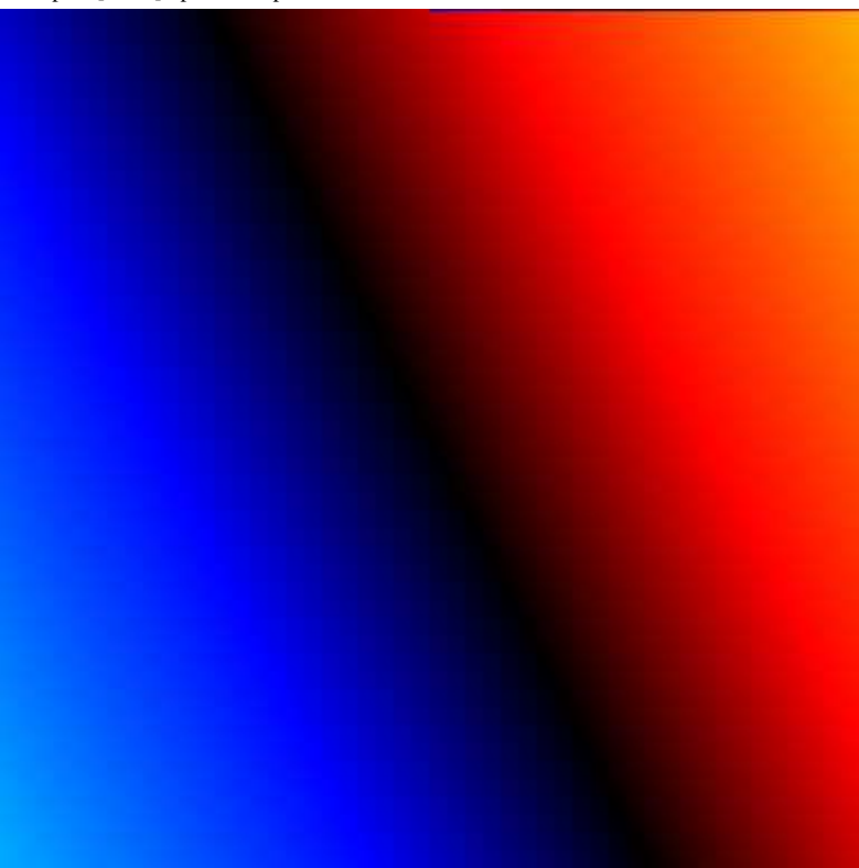
X-disp fit [-1,+1] opticsGroup1